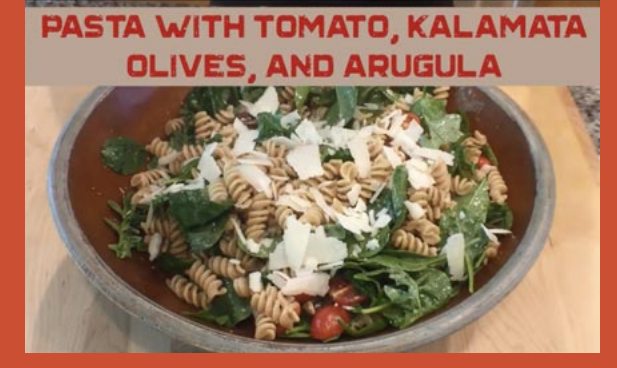
Pasta with tomato, kalamata olives and arugula